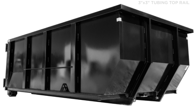
3"X3" TUBING TOP RAIL