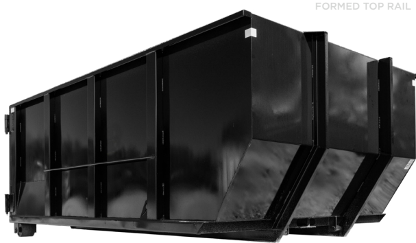
FORMED TOP RAIL